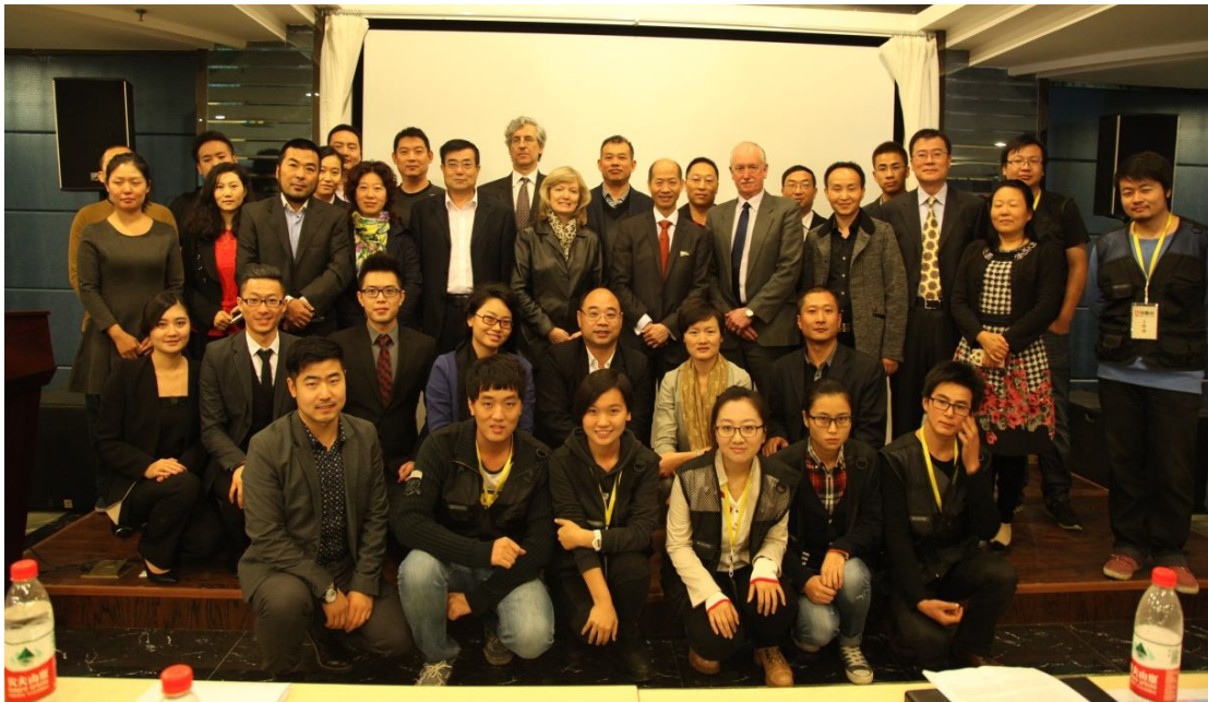
图 4: 旭富团队、柯赞事务以及郑州主办方等合照

Evotech Capital, Cozen law firm, Zhengzhou organizers and businessmen