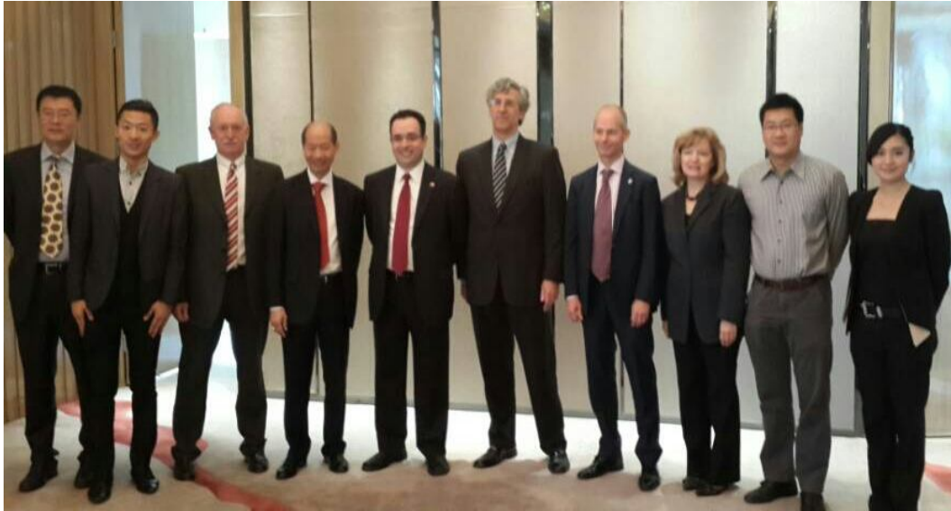
图 2: 旭富团队、柯赞律师事务所、致同会计事务所和美国总领事及美国加州中国贸易投资办公室主任合照

Photo of Evotech team, Cozen law firm and Grant Thornton accounting firm and U.S. Consulate General with U.S. California China Trade and Investment Office Executive Director